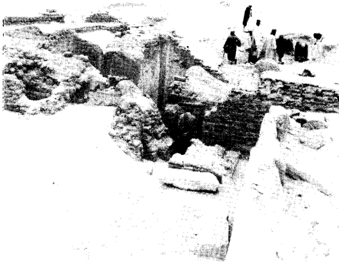
Macquarie University Concession at Saqqara

As reported in the last Newsletter, Macquarie University obtained a Concession to excavate a large area at Saqqara to the NW of the pyramid of King Teti founder of Dynasty VI (c. 2345 B.C.).